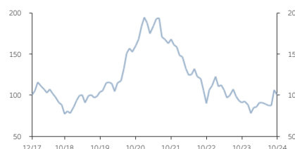
■ Class AT (USD) Acc.