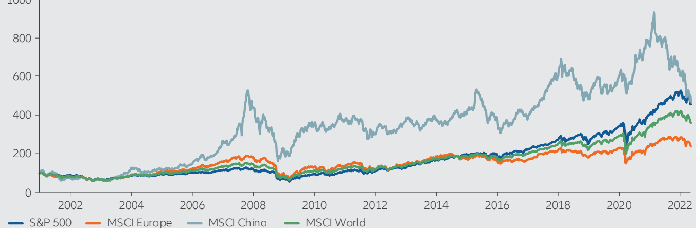
Exhibit 5: MSCI China, MSCI ACWI, MSCI Europe and S&P 500 performance since 2001 (in USD, indexed to 100)

Data as at 30 April 2022. Based on total return performance in gross, in USD. Past performance is not indicative of future results. Investors cannot invest directly in an index.